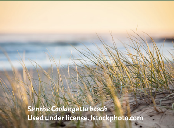
Sunrise Coolangatta beach

They said to each other, “Were not our hearts burning within us while he was talking to us on the road, while he was opening the scriptures to us?”