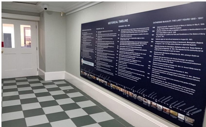
Corridor Historical Timeline.