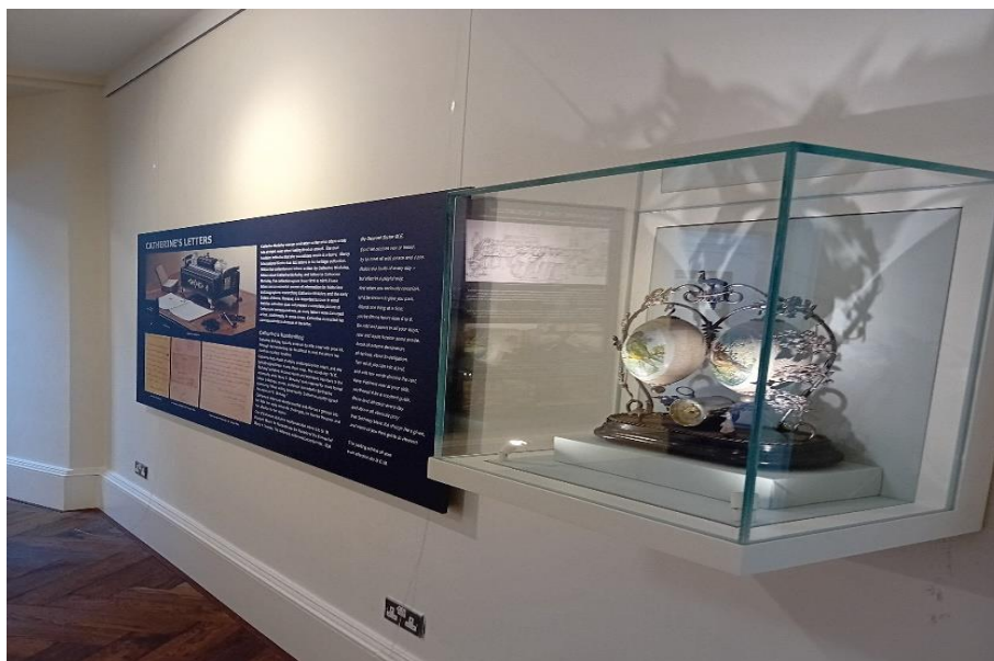
The Emu Egg Clock.