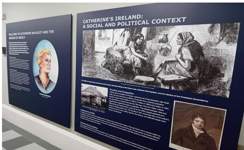
Corridor Welcome Message.