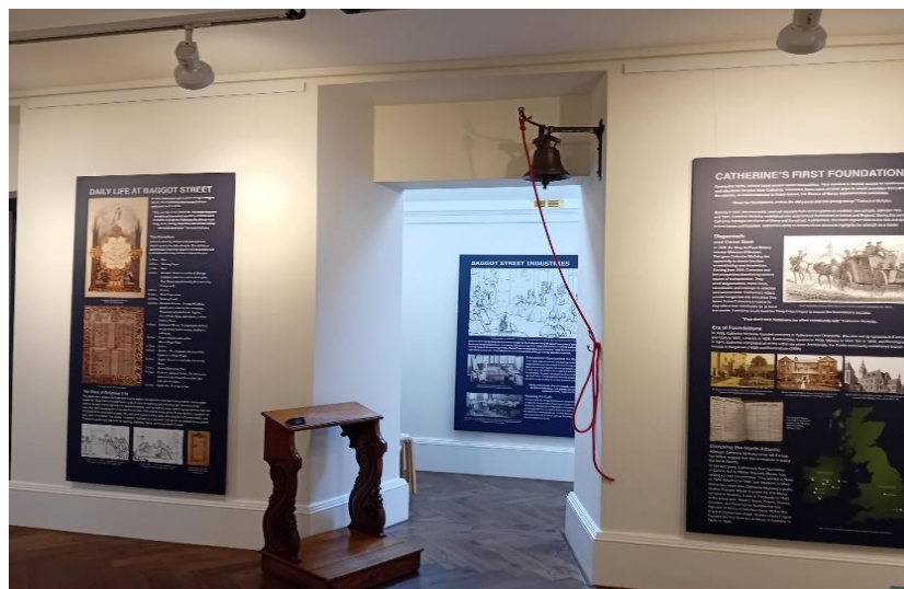
Prayer Bench & Original Convent Bell.