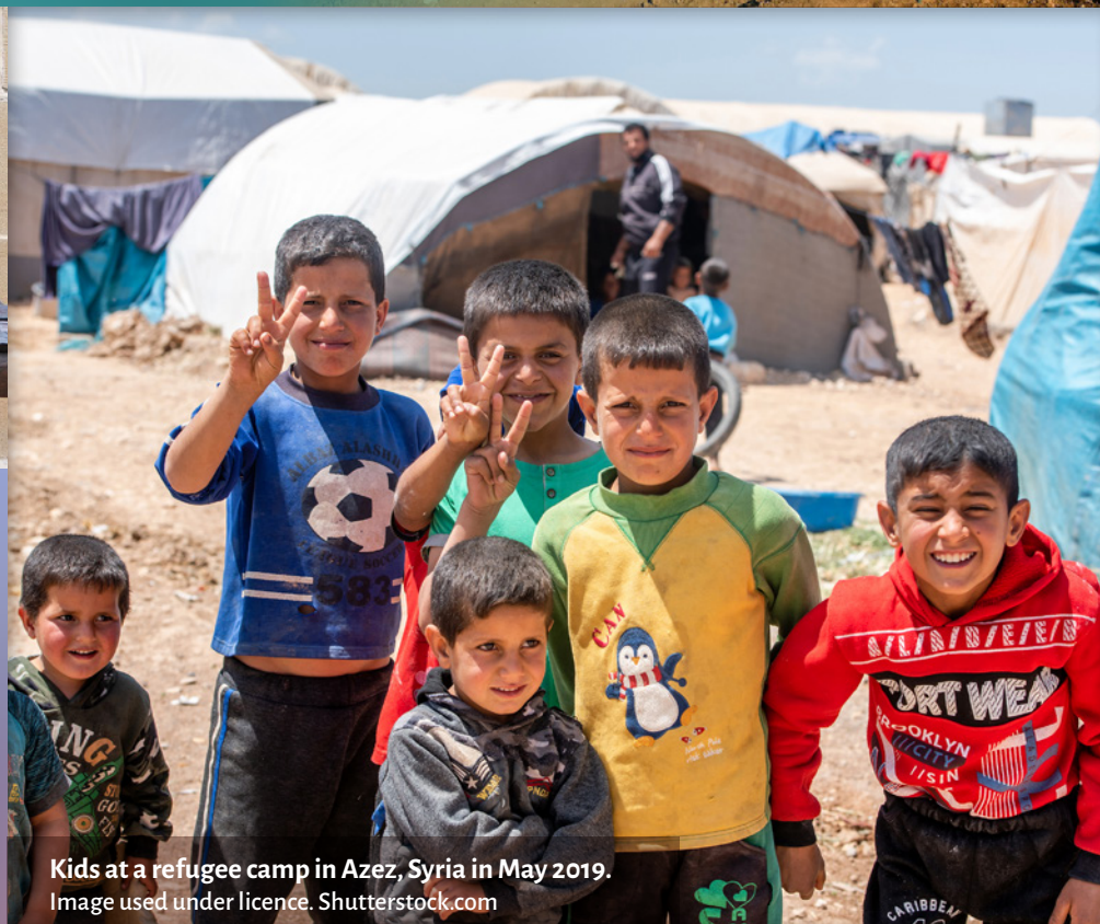
Kids at a refugee camp in Azaz, Syria in May 2019.

‘In the midst of this dramatic situation of COVID-19, which has “displaced” so much in our lives and in our world, we may have difficulty seeing, feeling and hearing the effects of this resurrection. This context reminds us of something we already know and which we too often forget: that it is the crucified one who is the risen one. The word of God comes to aid our fragile memory.’