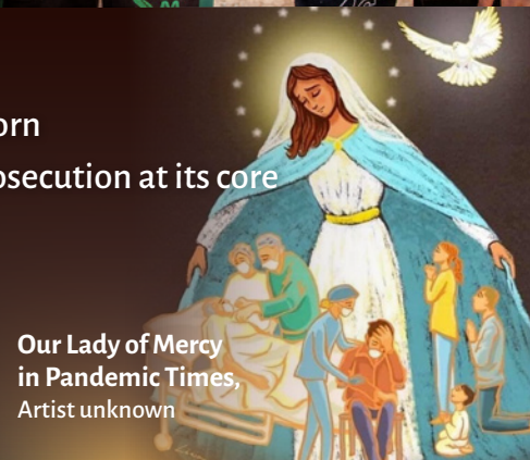
Our Lady of Mercy in Pandemic Times, Artist unknown

‘This story [of the Canaanite woman – Matt 15:21-28] sets forth who Jesus is as the Christ, the anointed one who reveals in painful human interactions what God is like. And that awareness and transformation in the very human Jesus came as a result of the actions of one of the poorest of the poor, the outcast, the ‘other’. Through this profound encounter, both Jesus and she were liberated.’