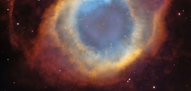
The Helix or “Eye of God” Nebula

‘Walking with people of faith seeking understanding and meaning today, as a catechist, I share in the creative work of God, leading people out of darkness into light, out of the slavery of literalism into the freedom of the daughters and sons of God, out of fear into wonder and awe.’