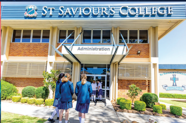
St. Saviour's College, Toowoomba, Queensland, Australia

‘St Saviour's is a richly diverse community which clearly has faith, traditions, and mercy at the heart. The inclusive nature of the school ensures that a lived faith experience is provided, and each student is valued for the unique contribution they make.’