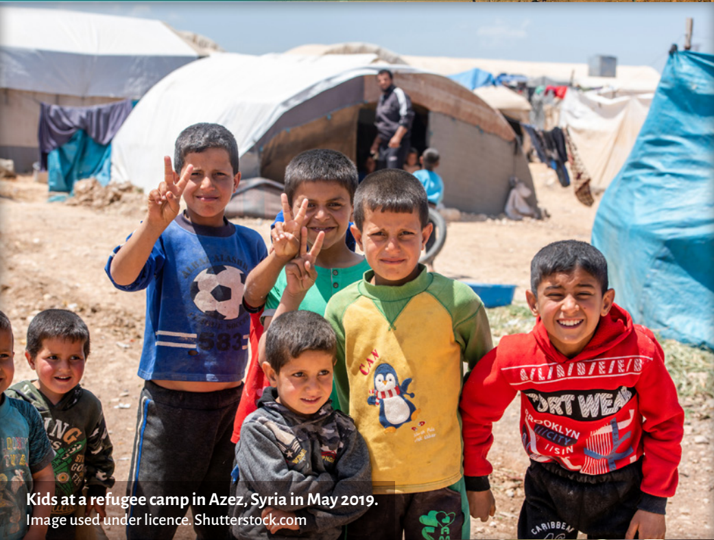
Kids at a refugee camp in Azez, Syria in May 2019.

‘In the midst of this dramatic situation of COVID-19, which has “displaced” so much in our lives and in our world, we may have difficulty seeing, feeling and hearing the effects of this resurrection. This context reminds us of something we already know and which we too often forget: that it is the crucified one who is the risen one. The word of God comes to aid our fragile memory.’