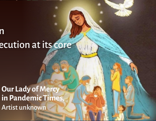
Our Lady of Mercy in Pandemic Times, Artist unknown

‘This story [of the Canaanite woman – Matt 15:21-28] sets forth who Jesus is as the Christ, the anointed one who reveals in painful human interactions what God is like. And that awareness and transformation in the very human Jesus came as a result of the actions of one of the poorest of the poor, the outcast, the ‘other’. Through this profound encounter, both Jesus and she were liberated.’