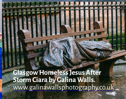
Glasgow Homeless Jesus After Storm Ciara