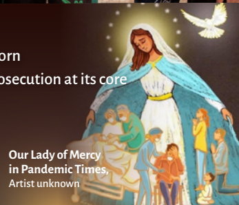
Our Lady of Mercy in Pandemic Times, Artist unknown

'This story [of the Canaanite woman – Matt 15:21-28] sets forth who Jesus is as the Christ, the anointed one who reveals in painful human interactions what God is like. And that awareness and transformation in the very human Jesus came as a result of the actions of one of the poorest of the poor, the outcast, the 'other'. Through this profound encounter, both Jesus and she were liberated.'