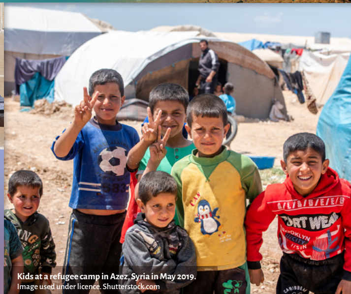
Kids at a refugee camp in Azaz, Syria in May 2019.

'In the midst of this dramatic situation of COVID-19, which has "displaced" so much in our lives and in our world, we may have difficulty seeing, feeling and hearing the effects of this resurrection. This context reminds us of something we already know and which we too often forget: that it is the crucified one who is the risen one. The word of God comes to aid our fragile memory.'