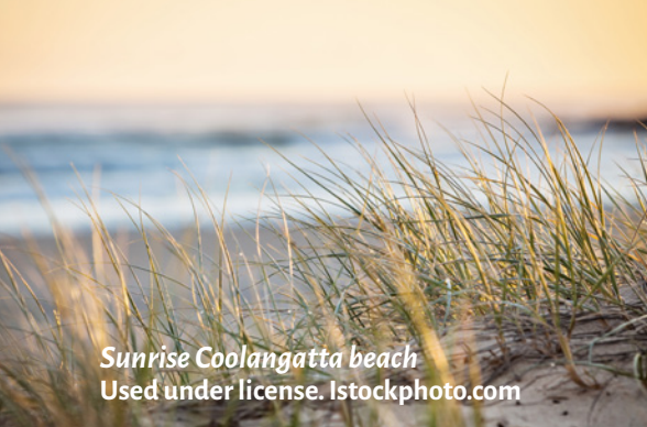
Sunrise Coolangatta beach

They said to each other, “Were not our hearts burning within us while he was talking to us on the road, while he was opening the scriptures to us?”