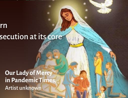
Our Lady of Mercy in Pandemic Times, Artist unknown

‘This story [of the Canaanite woman – Matt 15:21-28] sets forth who Jesus is as the Christ, the anointed one who reveals in painful human interactions what God is like. And that awareness and transformation in the very human Jesus came as a result of the actions of one of the poorest of the poor, the outcast, the ‘other’. Through this profound encounter, both Jesus and she were liberated.’