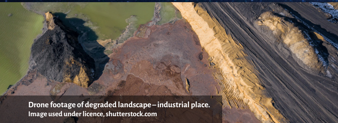
Drone footage of degraded landscape – industrial place.

‘The degradation of Earth led to a three-layered emergency visible in global climate change, approaching tipping points of ecosystems (Amazon, Arctic, Australia, and Antarctic), and the unprecedented threat of biodiversity loss and habitat destruction.’