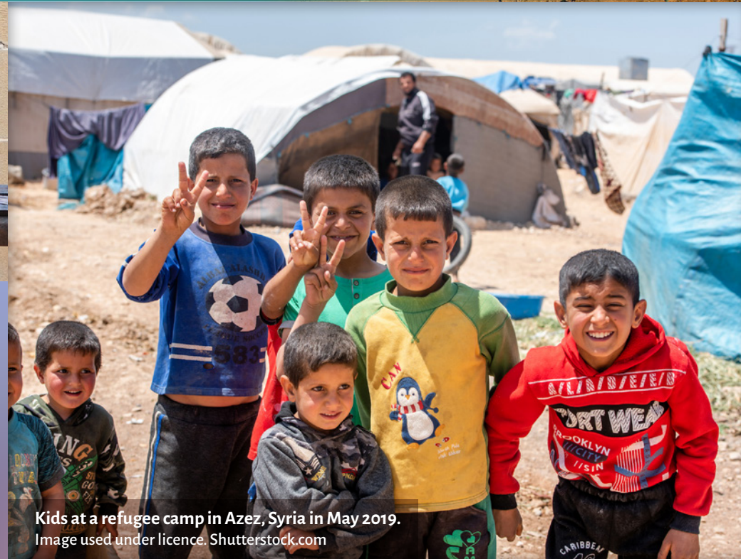
Kids at a refugee camp in Azez, Syria in May 2019.

‘In the midst of this dramatic situation of COVID-19, which has “displaced” so much in our lives and in our world, we may have difficulty seeing, feeling and hearing the effects of this resurrection. This context reminds us of something we already know and which we too often forget: that it is the crucified one who is the risen one. The word of God comes to aid our fragile memory.’