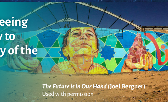
The Future is in Our Hand (Joel Bergner) Used with permission