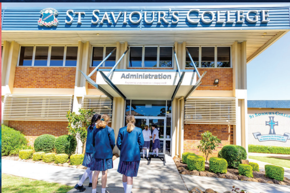
St. Saviour's College, Toowoomba, Queensland, Australia

‘St Saviour's is a richly diverse community which clearly has faith, traditions, and mercy at the heart. The inclusive nature of the school ensures that a lived faith experience is provided, and each student is valued for the unique contribution they make.’