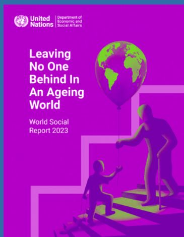
UNDESA World Social Report 2023