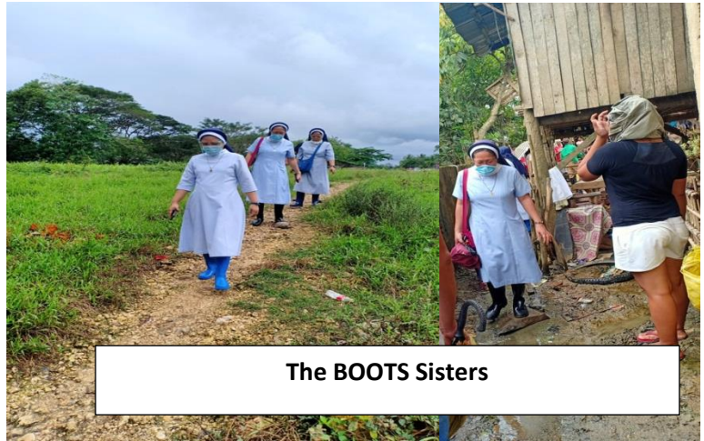
The BOOTS Sisters

The present global situation never hindered people's generosity, the Douglas Fund through Mercy International Association (MIA) offered a special grant to the Sisters of Mercy Philippines to help the people who have been a victim of the recent