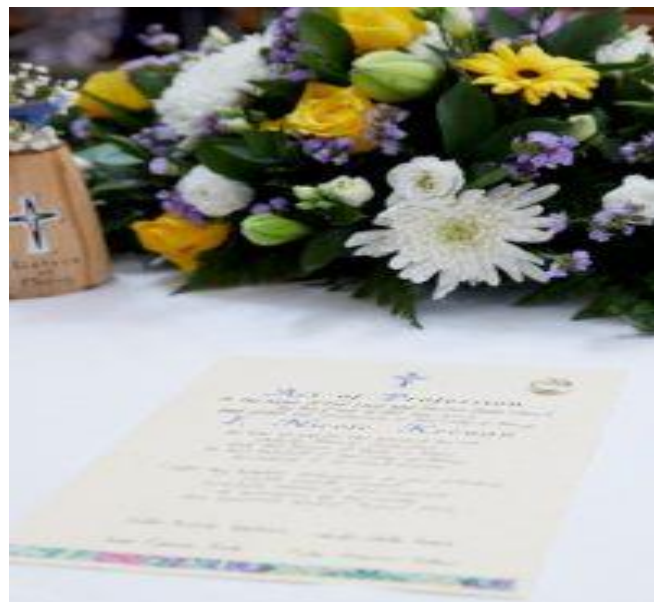
Act of Profession with Flowers