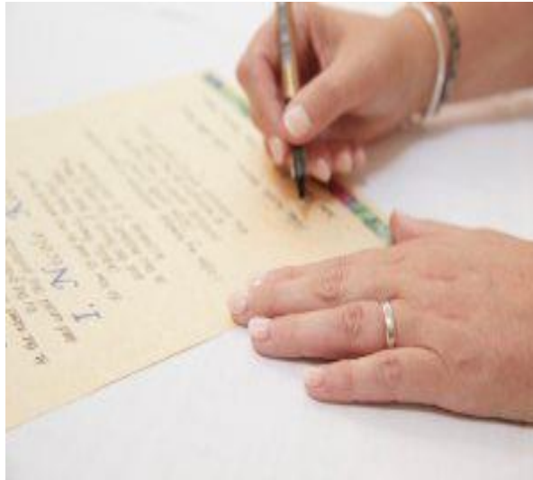
Signing the Act of Profession