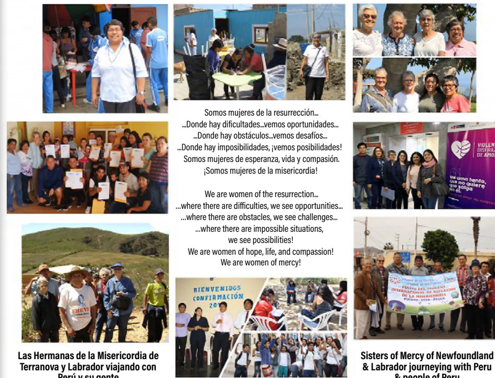
Las Hermanas de la Misericordia de Terranova y Labrador viajando con Perú y su gente