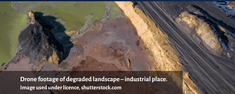
Drone footage of degraded landscape—industrial place.

‘If the defacement of the poor is a defacement of God, in the same way a defacement of Earth is a defacement of God... From now on, caring for the environment has to be understood as being at the core of what mercy is, of what mercy asks us to do.’