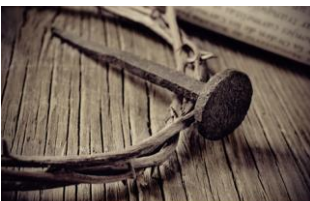
End the Violence. End the Silence

Speaker 1: And so we gather at the foot of the cross, on this Earth tread by Christ, on holy ground. On the mountain, in the suburb, in the desert, on the plains, by the sea, we are on holy ground. May we acknowledge the Creator of the land beneath us and resolve to continue in the sacred work of caring for all creation.